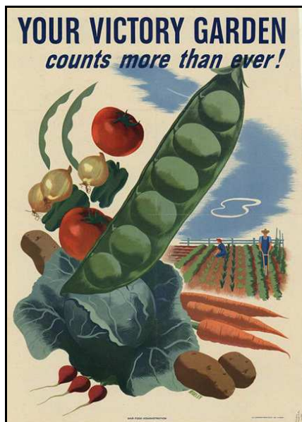
A WWI era poster.

What might not be so obvious yet is the pressure on farmers, who must deal with increases not only in fuel prices, which affect nearly all aspects of production, but also seed, feed, and fertilizer prices. Adding to this mix are the harmful government policies that depress the prices farmers can get for their produce and livestock, the continuing wave of farm foreclosures (and the subsequent