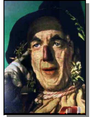
“... some people without brains do an awful lot of talking ... don’t they?” Ray Bolger as the Scarecrow.

In the end, once you see through all the false claims, these Private Offset Discharging and Indemnity Bonds are good for only one thing: an 18 USC § 514 conviction (passing fictitious financial instruments). So use the brain that the good Lord put in your head, and stay away from the wizards who try to foist these treacherous pieces of paper on you.